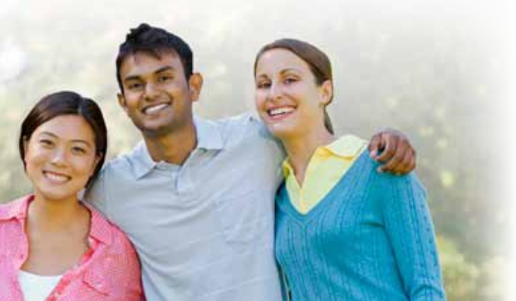
Single-Site™ da Vinci Surgery